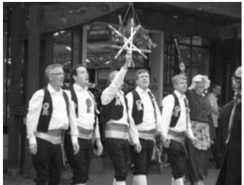
The Hoddesdon Crownsmen's 40th birthday 2010

The Hoddesdon Crownsmen danced rapper, a traditional form of dance from the North East of