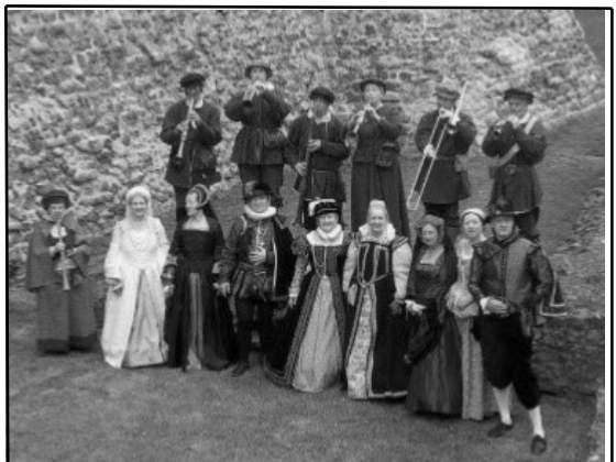
Colchester Waits and Colchester Historical Dance

In our second and third set we were dancing in the arena where the enactors