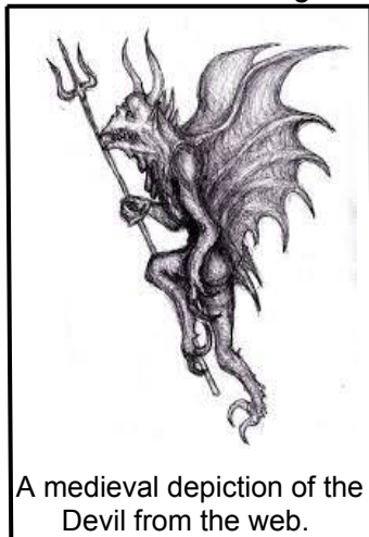
A medieval depiction of the Devil from the web.